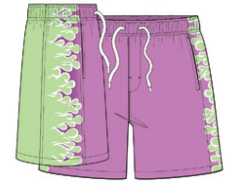
HELLS SP BS413