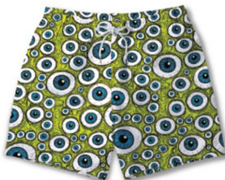
EYES LIME BSFOS2