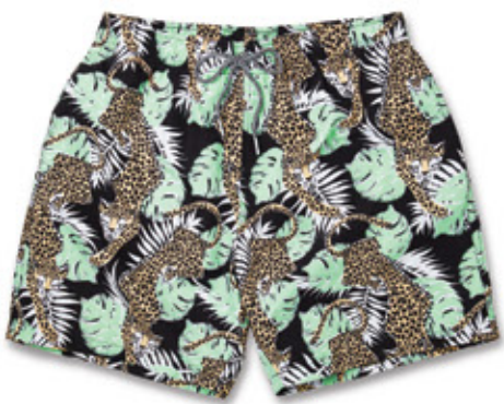
PURFECT PARADISE BS402