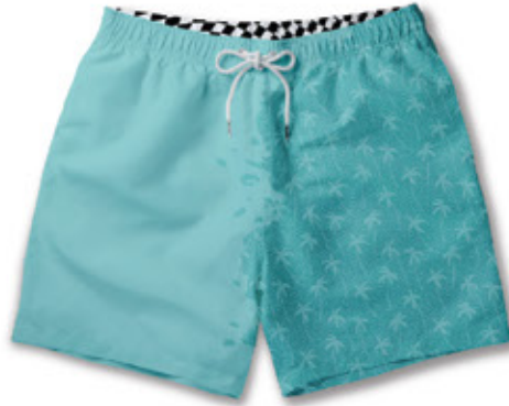
MINT GREEN BS419