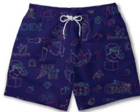
SIN CITY BSB001