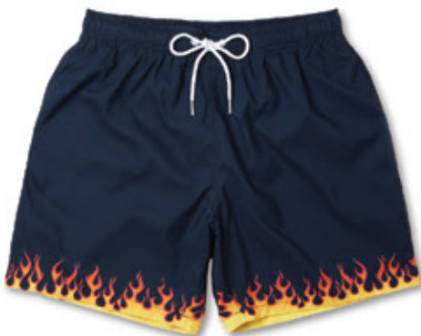
HELLS POINT BS301