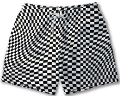
WARPED CHECK BS409