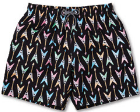
FLYING V'S BS408