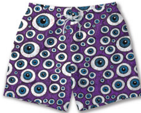
EYES PURPLE BSFOS1