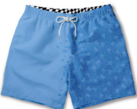
LIGHT BLUE BS420