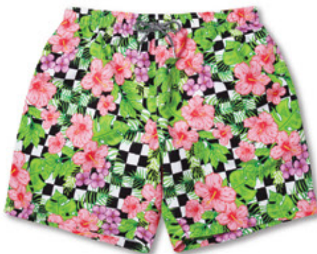
CHECKER FLOWER BS304