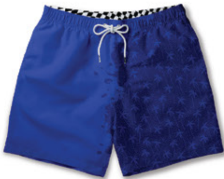
DARK BLUE BS422