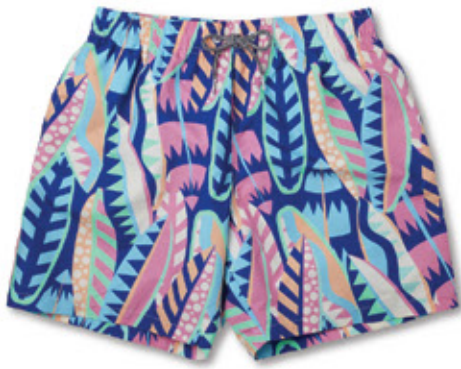
ON BOARD BS405