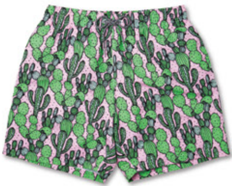
DRY HEAT BS326