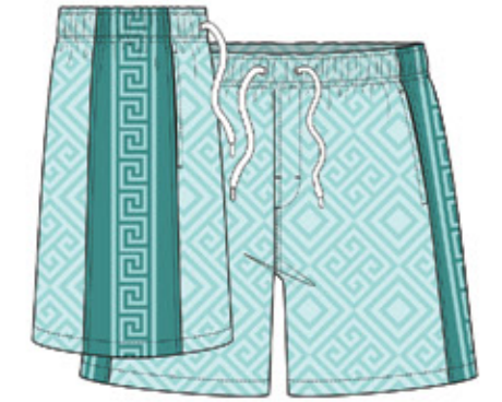
GRECO SP BS414