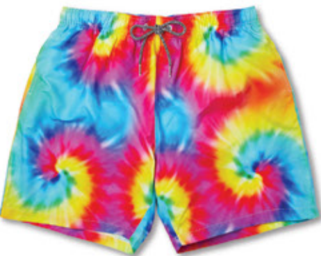
SPIRAL TIE DYE BS322