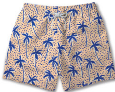
FLAIR PALM BS301