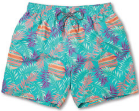
RISEING PALM BS406