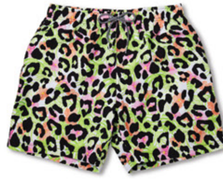
TROPICAL CHEETAH BS324