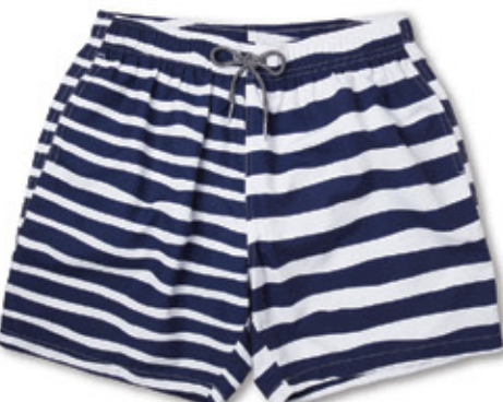
DOUBLE STRIPE BS416