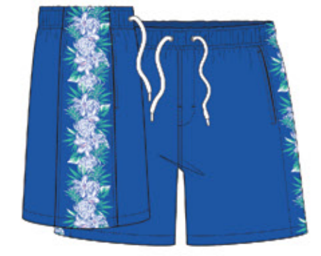
ALOHA SP BS412