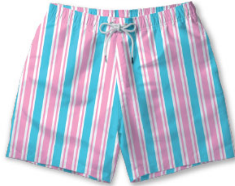
CANDY STRIPE BSK417