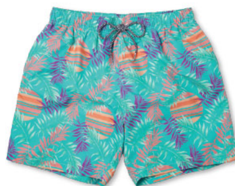
RIISING PALM BSK406