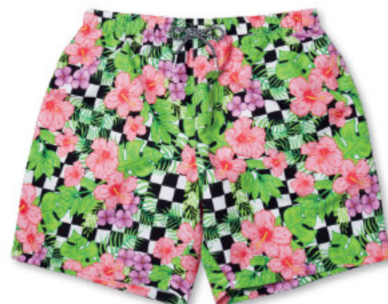
CHECKER FLOWER BSK304