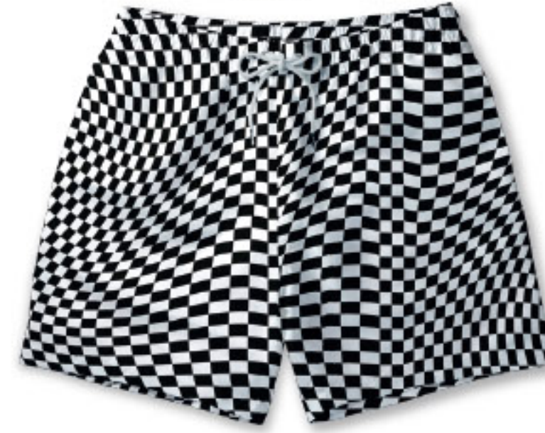
WARPED CHECK BSK409