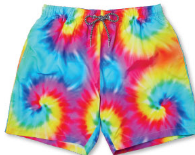
SPIRAL TIE DYE BSK322