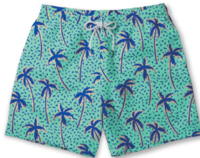
FLAIR PALM BSK401