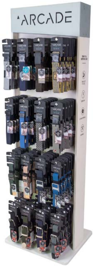
FLOOR DISPLAY DOUBLE-SIDED. HOLDS 192 BELTS. 50cm W X 44cm D X 158cm H MINIMUM ORDER 120 BELTS.

Arcade belts aren't meant to be stuck in the back corner of your store. Our packaging and merchandising program is designed to add flavor to your floor while boosting sell through.